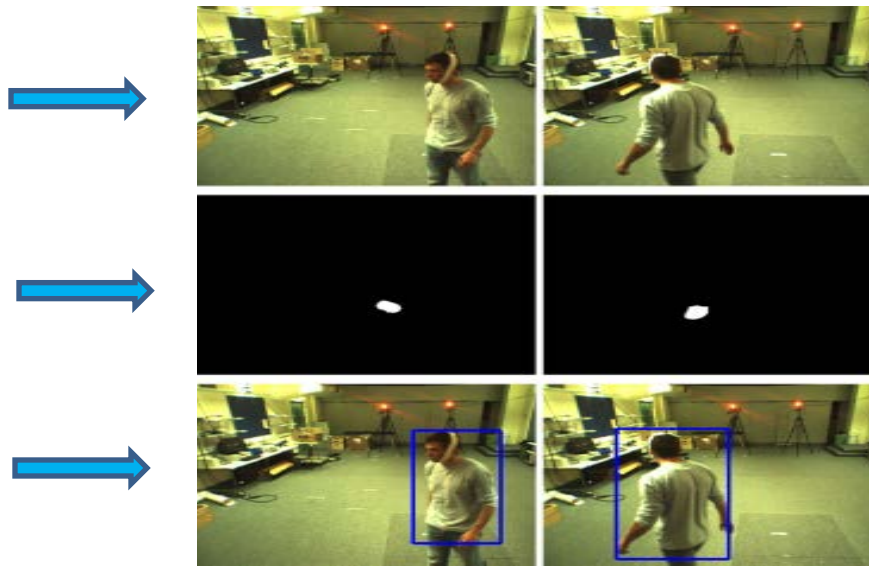
Fig.2 First row indicates the original image, Second row shows the segmented object and Third row shows the detected object.

MATLAB with a 4GB RAM, Pentium processor. The images are taken from Vicon system which will be shown below. Figure 2 shows the detection results.